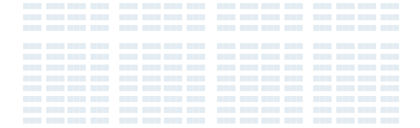
The 2004 BCG Attorney Search Guide TO CLASS RANKING DISTINCTIONS AND LAW REVIEW ADMISSION AT AMERICA'S TOP 50 LAW SCHOOLS